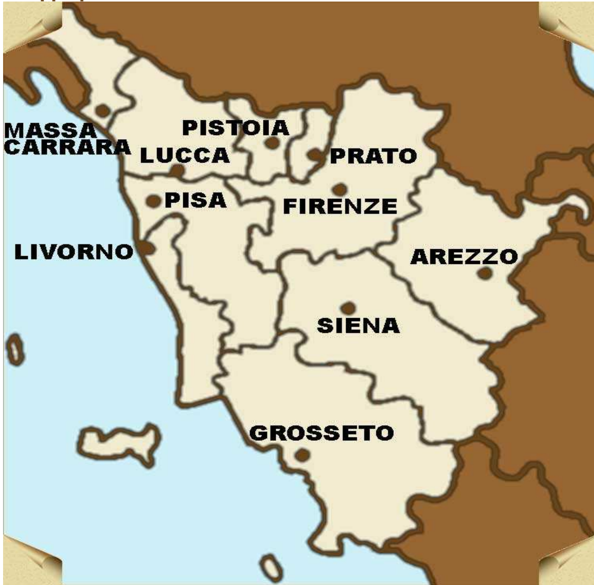
Mappa province della Toscana